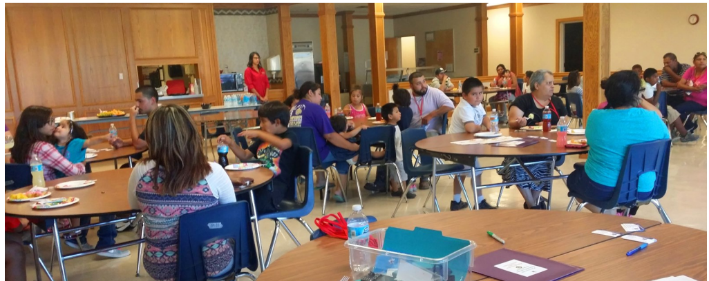
The Migrant Education Program held their first parent meeting of the year on September 15. During the meeting they elected parent representatives, learned general information about the migrant program, and spent time getting to know the Migrant Department staff.

PESSA (Plainview Educational Support Staff Association) is selling RADA cutlery..