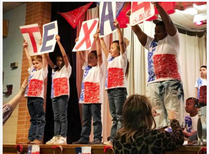
College Hill first grade presents "Wee Sing America."