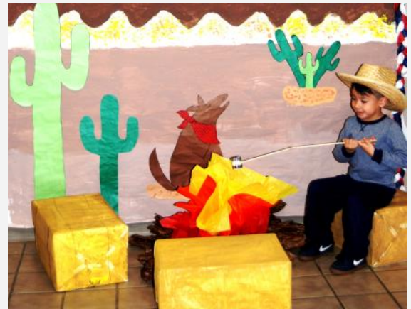
A La Mesa student poses before their mock campfire.