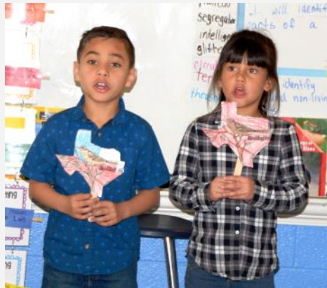
Hillcrest 1st graders practice for their parent program.