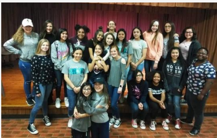
Coronado Choir entertains parents and students during lunch.