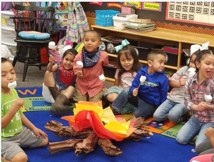
Edgemere students "roast" marshmallows over a mock campfire.