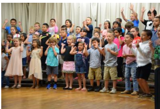
LOOK OUT FIRST GRADE, HERE WE COME! College Hill kindergarten students entertain parents with songs about all they have learned this year and why they are ready for first grade.