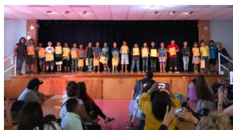
BUSY DAYS at HIGHLAND - Lots of fun packed in to the last days of school at Highland with field day, awards ceremonies and Pass the Torch.