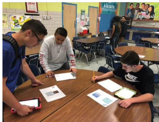
Coronado and Estacado 8th Grade students participating in a two day Science and Social Studies STAAR Boot Camp. Stations were organized by teachers to help students review essential content on Monday and Tuesday before the STAAR Assessments.