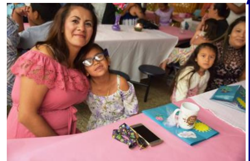
Thunderbird second grade students invited their mothers to a tea in celebration of Mother's Day.