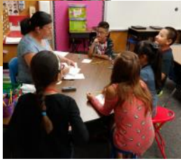
SATURDAY BOOT CAMP - Thunderbird students setting high goals and putting in some extra time to prepare for STAAR testing.