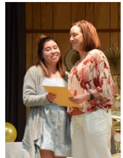
Ash High School celebrated graduating seniors with a scholarship and awards banquet.