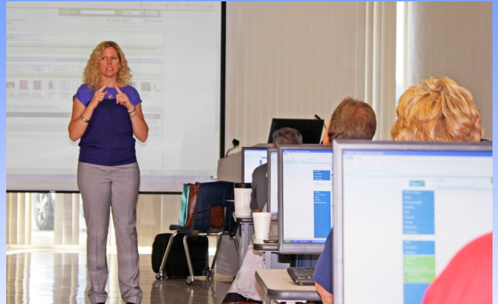
Principals and campus staff recently participated in training on Project Share provided by ESC 17.

If you aren't there yet, don't be discouraged. You still have time. Begin by taking the steps you can—master your Mobi, your document camera, and clickers if you have them. You can explore Project Share by utilizing the Project Share Tour or the Project Share videos on YouTube. If you are a middle school or high school teacher,