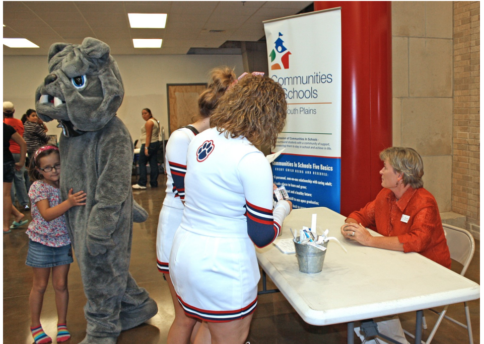
WE LOVE OUR BULLDOG MASCOT! A young visitor surprises the Bulldog mascot with a hug during the PHS Open House at the Communities in Schools table. (See page 2 for more information on CIS.)