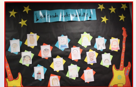
La Mesa Where Learning Rocks Every Day