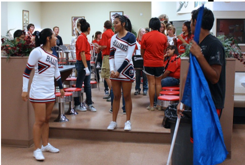
PHS cheerleaders and band prepare to march through the hallways during open house.