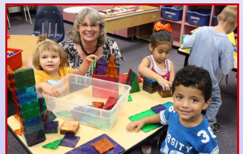
La Mesa Learning Academy