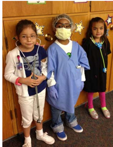
Thunderbird students dressed for Little Kid Career Day show their school spirit.