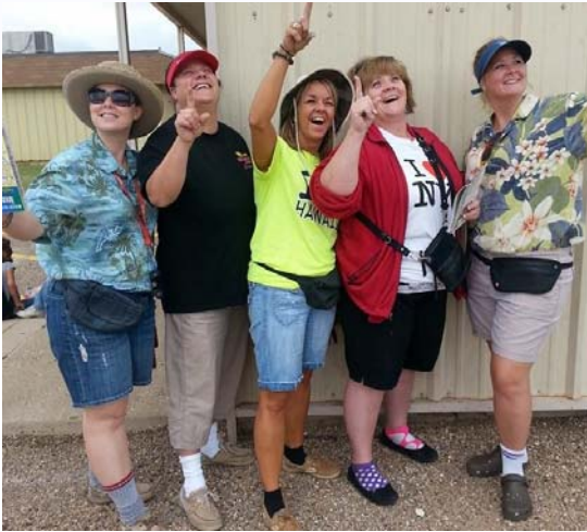
Tacky Tourist Day at College Hill brought out the adventurous side in these teachers.