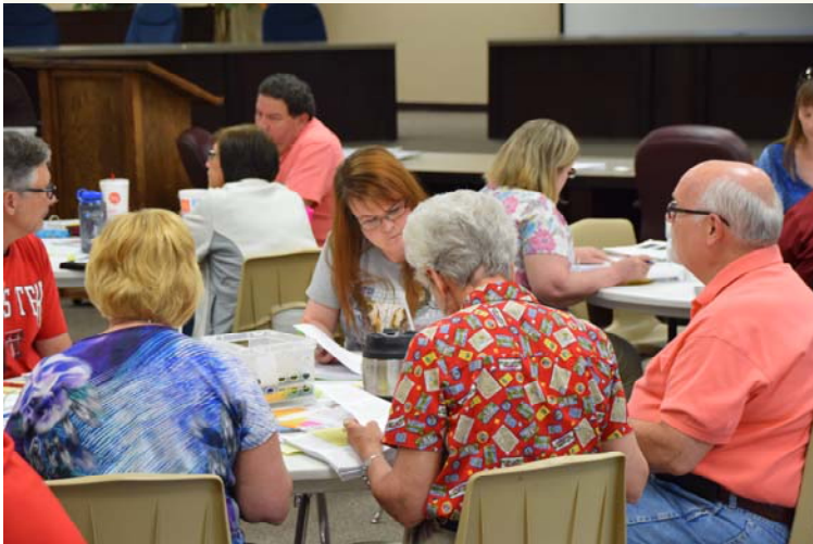
Secondary teachers attended training on using Content or Discipline Literacy during the summer staff development sessions.