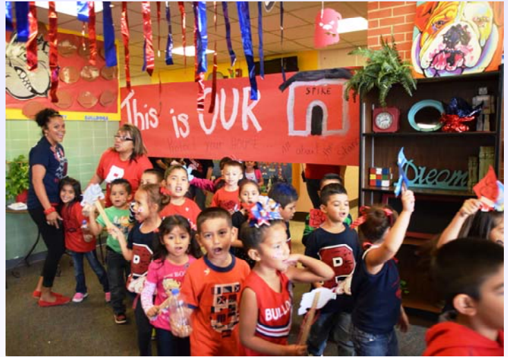
Thunderbird staff and students dressed up their school in support of the Bulldogs and line up to greet the team on Homecoming Day.