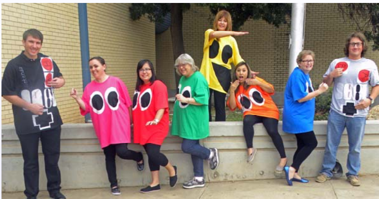
Coronado's "Math Pac" dressed PAC-MAN Style for Team Day. Note the game controllers on the left and right sides.