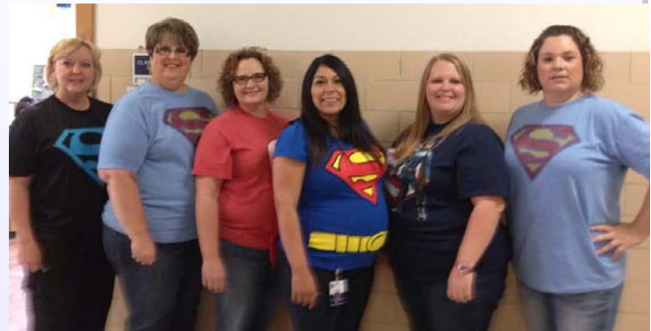
Team Day at PHS inspired this team of Super Teachers to dress in their Super Hero t-shirts.