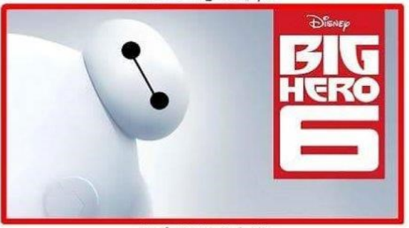
Movie starts at dusk

Kidsville Park, Plainview, TX Activities & Refreshments available Festivities begin at 7pm!