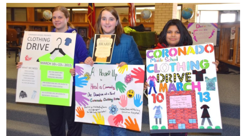
Coronado's clothing drive also included a poster contest for students.