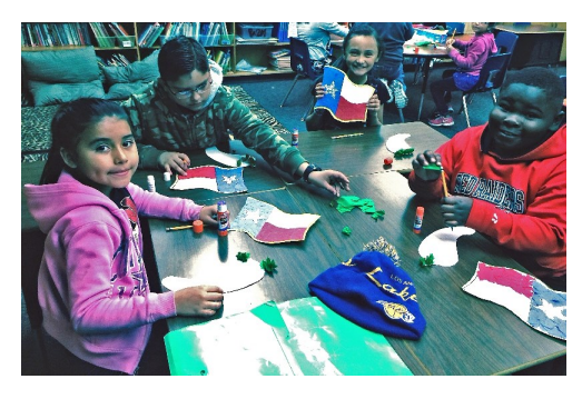
Thunderbird students work on Texas art to decorate the schools hallways.