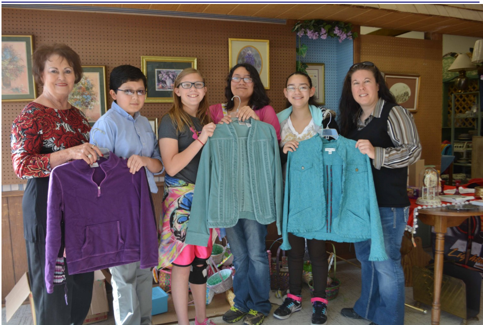
COMMUNITY SERVICE Coronado students celebrated Texas Public Schools Week with a community service project. They held a clothing drive to benefit the Hale County Crisis Center. Several students also volunteered time during Spring Break to deliver the clothing to the resale store, Broadway Treasures.