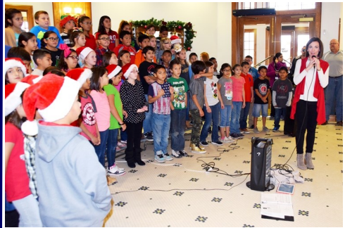
College Hill Carolers