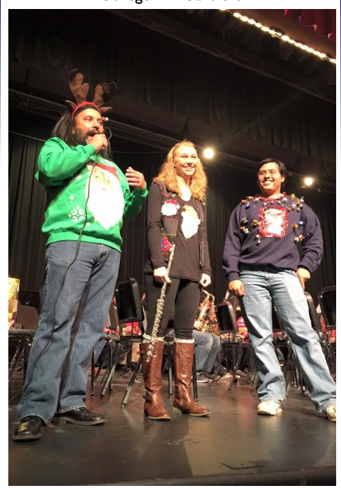
PHS Band Christmas Concert