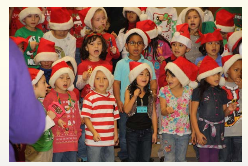
Highland students singing Christmas carols at a local bank.