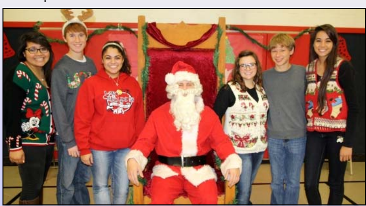
PHS Student Council officers pose with Santa prior to the annual STUCO party for special needs students. Everyone involved had lots of fun and even made a few new friends.