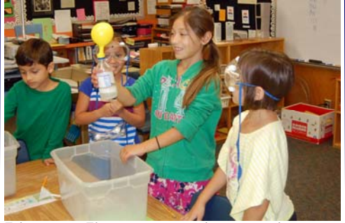
Edgemere Elementary students conduct an experiment during an SOS day.